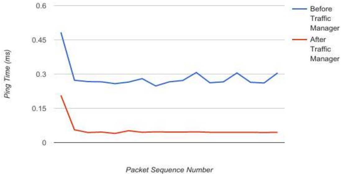
Fig.1 Ping Time Before and After Traffic Manager Application